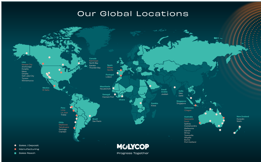
Figure 1: Overview of Molycop corporate group global operations and locations.

Each region operates with a degree of autonomy but with shared resources (such as global support teams, policies and procedures) and common senior leadership structures to ensure consistency in functionality and coordination of activities.